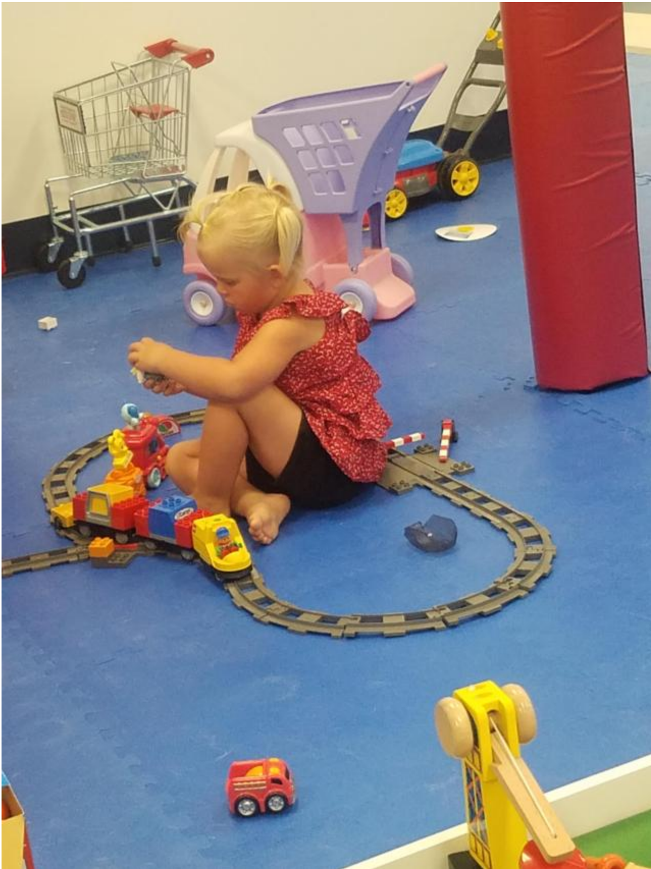
EDWARDSVILLE - There was nothing but smiles on the faces of those who attended the grand opening of We Rock the Spectrum Saturday at 1015 Century Drive, Edwardsville.